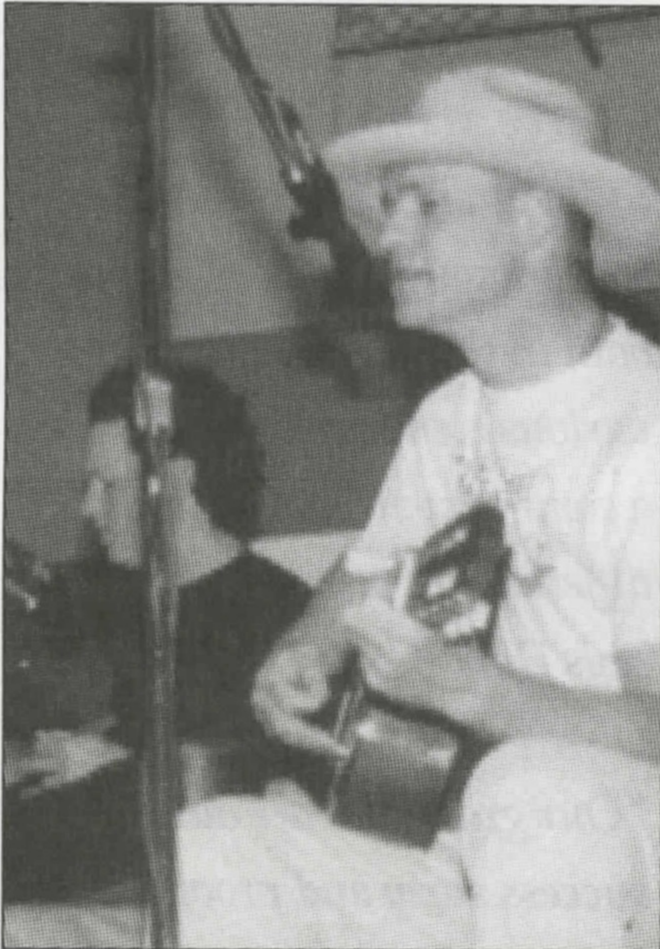
Johnny Fay and Gord Downie

From time to time, the Board of Governors of St. Lawrence recognizes the outstanding achievements of individuals or groups whose accomplishments are of such excellence, inspiration and leadership that they serve as an example for the graduates of our college.